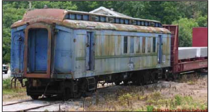
RPO 1107 being placed at it's temporary home in Auburn awaiting restoration.

Several members of the Friends of the L&N Depot camped out under the butterfly shed on the morning of Sunday, June 11th. They had been alerted that an extraordinary car would be making it's way down the CSX line that morning..