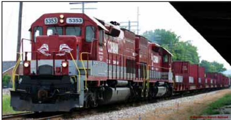
The R.J.Corman locomotive pulling the ingot train. The PRO can be seen well to the rear of the train.

and interior woodwork and setting the car up for an informational display which may include scenes of the normal day-to-day activities on an RPO.